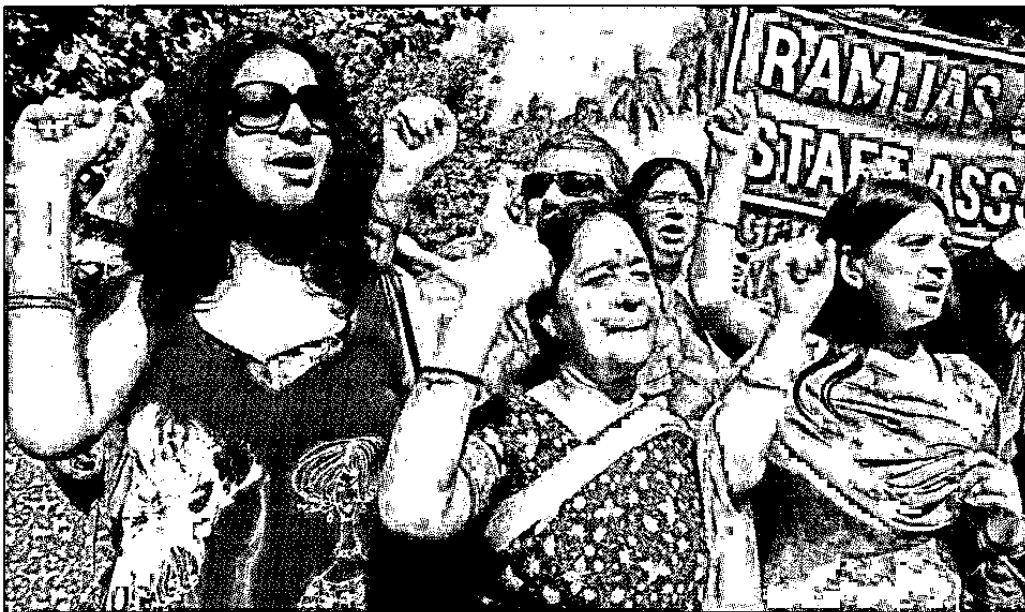
■ Teachers of some DU colleges have been stalling implementation of the semester system.

SEMESTER ROW DU teachers defied court's previous order not to strike till the disposal of case